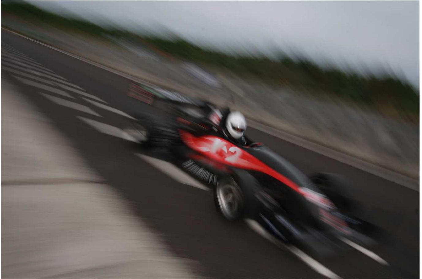
taken in the paddock lane at Pembrey